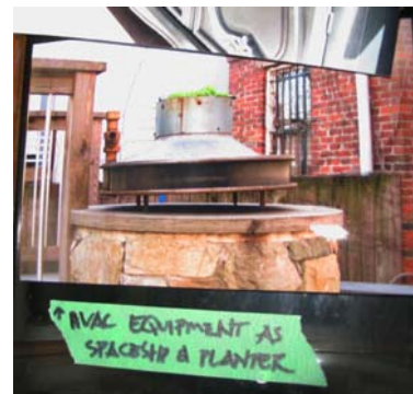
HVAC Equipment used as a Planter