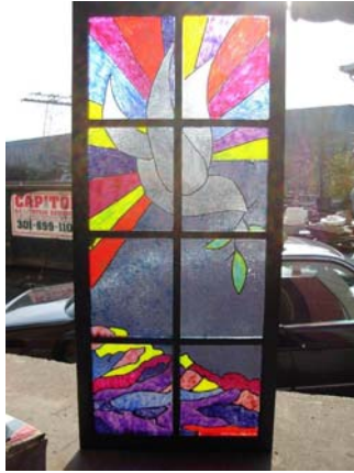
One piece of art Luci made from a CF window, on display in our warehouse!

To exhibit your creations, contact Luci at 703-653-4032, or lucijean@gmail.com