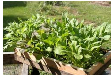
A salad table from reclaimed lumber