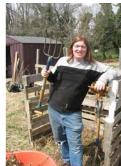
A compost pile made out of discarded pallets

Here's the contact info & links to the personal projects of all the presenters if you would like more info: