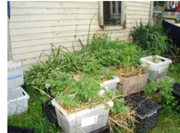
Potatoes in old crates