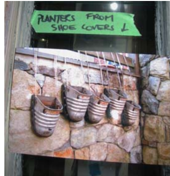
Planters from Shoe Covers